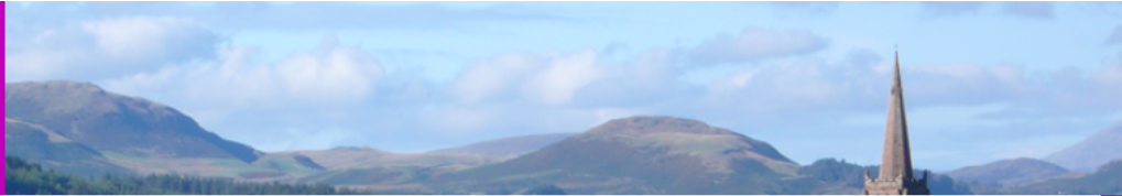
MILLOM AND DISTRICT