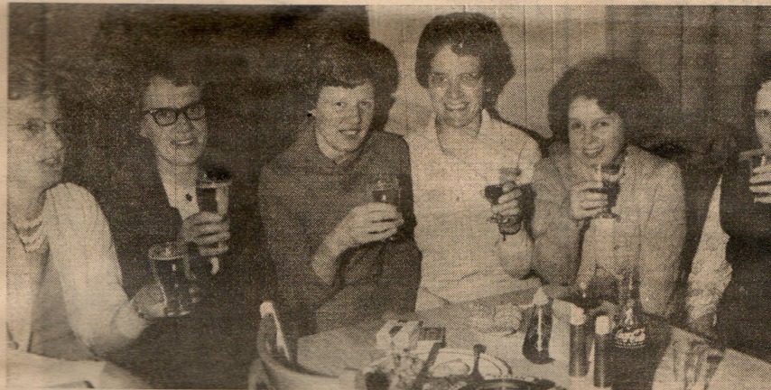
In obviously cheerful mood—lady members take time off for refreshment.

Yet in Milton two clubs, the Ritz and the Club while in the far, far town of Barrow there is one, the 99 — some "cousins"!